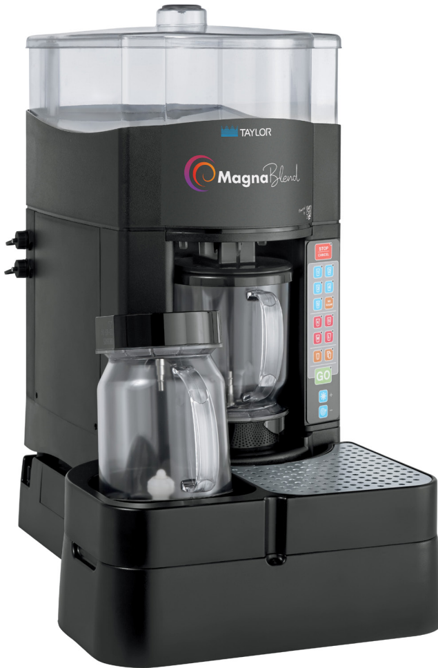
Shown with standard ice hopper