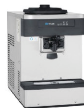
Taylor C152 Compact single-flavor soft serve machine