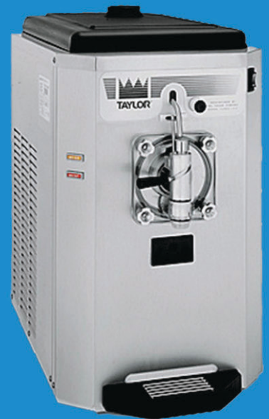
Taylor 430 Single-flavor frozen beverage machine