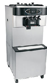
Taylor C716 Twin twist, heat-treatment soft serve machine for high-volume operations