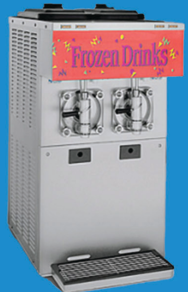
Taylor 432 Multi-flavor frozen drink machine for expanded menu options